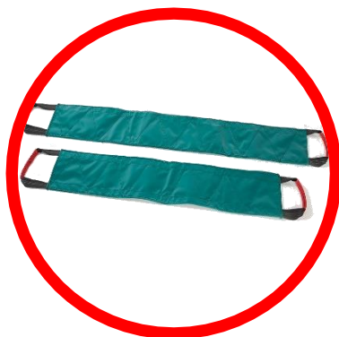
Casualty Handling Slings