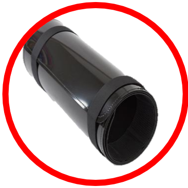
Replacement Sliding Board