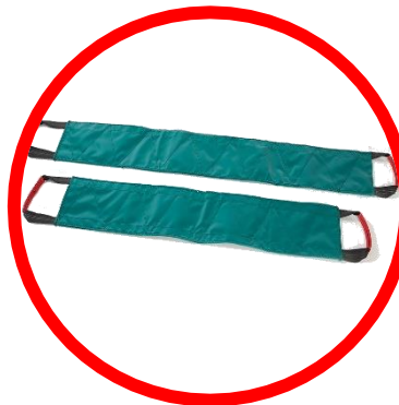
Casualty Handling Slings